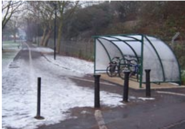
Bicycles chained to a fence opposite Perivale Station in April last year, and the new cycle-parking shelter at the same spot.

In our station parking survey last year, one of worst stations for cycle facilities was Perivale which had no stands. The best option for cyclists was a chain fence opposite the station (above left). Now, thanks to the Perivale Ward Forum, Ealing Council have built a new cycle shelter. Each ward in Ealing has a budget to spend on local improvements, and the public get to choose projects and vote on how the money is spent. The decisions are made at Ward Forums which are held four times